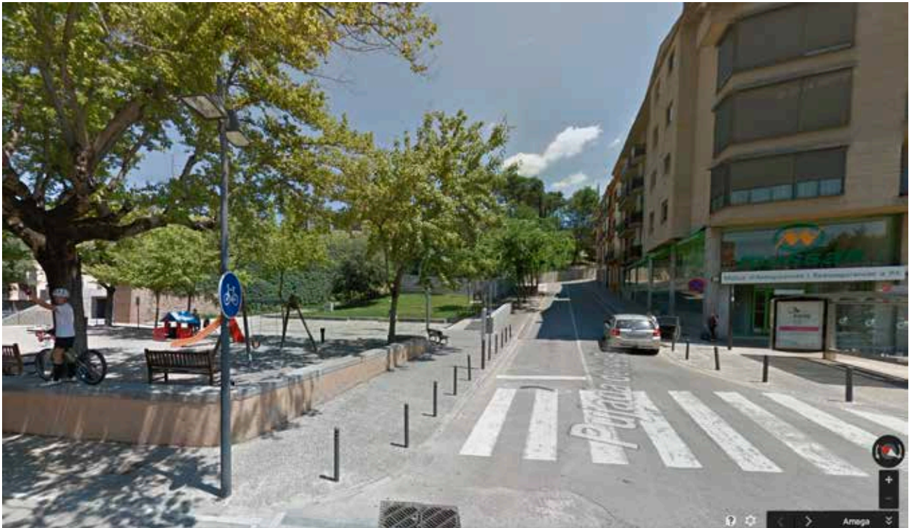
Drive up "Pujada de les Pedreres"